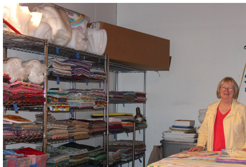
Community quilts fabric locker.

At this Free Open Sew the emphasis will be making Christmas stockings for our first non-profit recipient St. Vincent's PATHS. PATHS is a residential program that provides housing for 30 women with a limited income and their children ages birth to three years for