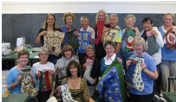
Participants at the Oct. 22 Open Sew; see article on page 5.

We just received a memo from Amazon that they have reinstated the Amazon Associates program in California after they signed an agreement with the governor. So please start purchasing through our unique Amazon link to help the guild in its fundraising efforts.