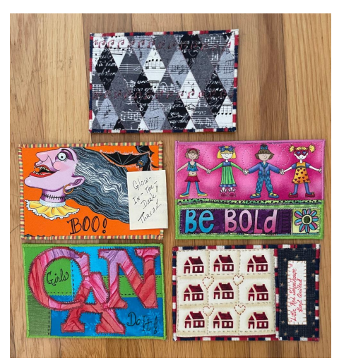
Lou Ann Schlichter's Postcards

The Quilted Postcard instructions and slideshow are available via this link on the main Guild webpage: www.coastalquilters.org/postcards.html