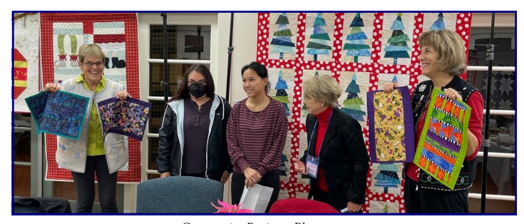
Community Projects Placemats

Guild members were treated to a full evening of fun and camaraderie on December 8 in the Fellowship Hall. Loads of delicious desserts were brought and enjoyed by all. Our meeting began with visiting and hanging the many holiday quilts brought by members. Quilted postcards were sold, as well as raffle tickets and "last-chance" Opportunity Quilt tickets.