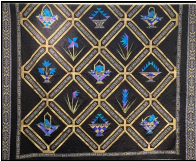
Note: top 10 inches of the quilt not shown

to help sell tickets at Guild meetings. If interested, email sgkadner@coastalquilters.org .