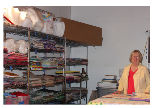
Community quilts fabric locker.

The Community Quilt Quartet will be hosting a Free Open Sew from 9 a.m. to 3:30 p.m. We will provide fabric and batting for our small projects. We also have a surprise instructor lined up to teach. Bring your own sewing machine and basic sewing supplies, cutting mat, rotary cutter, and a cushion to sit on as the chairs