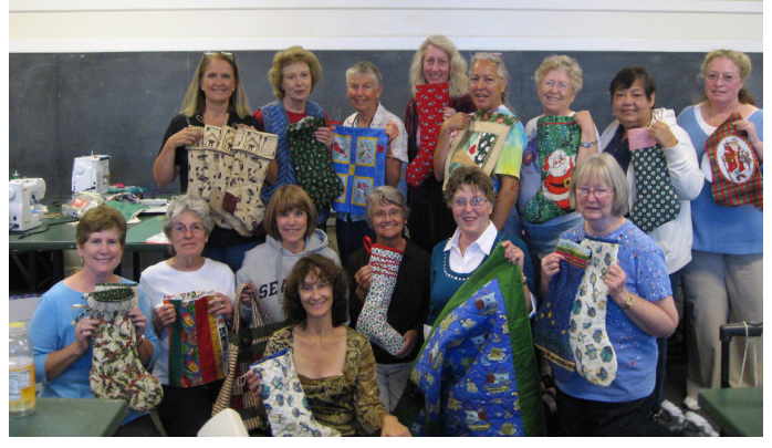
Participants at the Oct. 22 Open Sew; see article on page 5.

Amazon rewards are back! We just received a memo from Amazon that they have reinstated the Amazon Associates program in California af-ter they signed an agreement with the governor. So please start purchasing through our unique Amazon link to below the guild in its fundraising efforts.