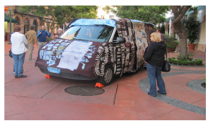
Did you see this quilted van at first Thursday in November?