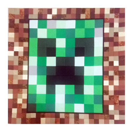
Mindcraft Creeper quilt by Bee Saunders