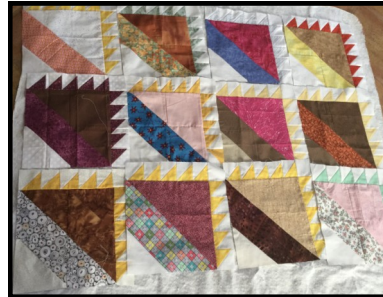
- Kika Hutchings, Block of the Month

Twelve blocks were submitted in January. These lovely blocks will be donated to the Treasure Table/Community Projects so they'll be available for anyone who's interested in them in the future.