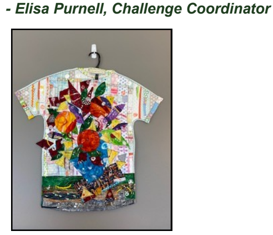
Honorable Mention: Pamela Holst