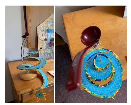
Most Creative: Patty Latourell