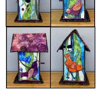
Honorable Mention: Linda Estrada