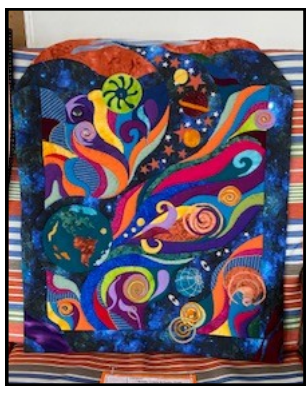
Best Use of Color: Pat Masterson