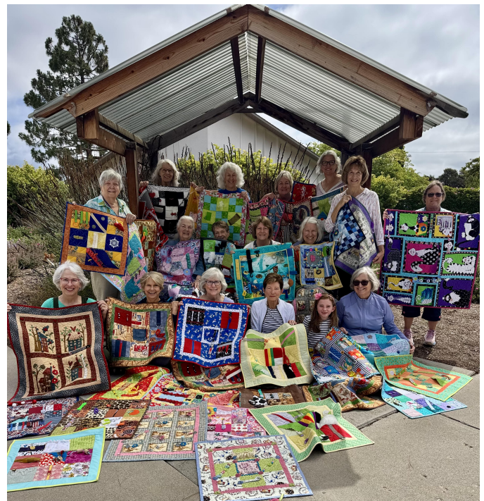
The satellite group, Running Stitches, shows off the 47 fidget quilts they've made for Oak Cottage and Community Projects.